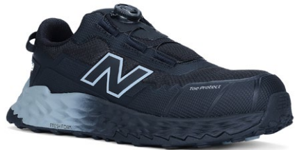
Fresh Foam Cremorne BOA Black/Grey - MEFCCAPBBG

Our unique anti-perforation is made from one of the three major high performance fibers in the world with strength ten times greater than that of high-quality steel and density lower than water. This anti-perforation delivers a soft, water resistant matter with excellent abrasion and flexing resistance.