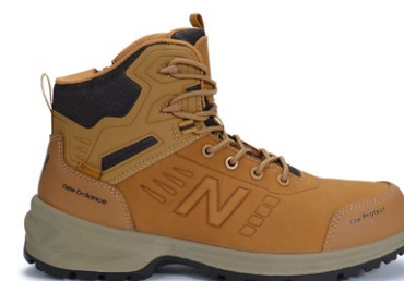
midclbre - wheat