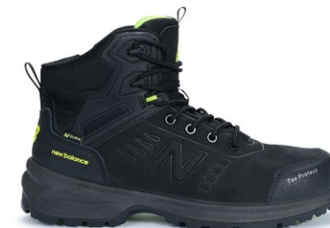
midclbre - black