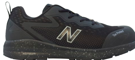
midlogi - black / orange