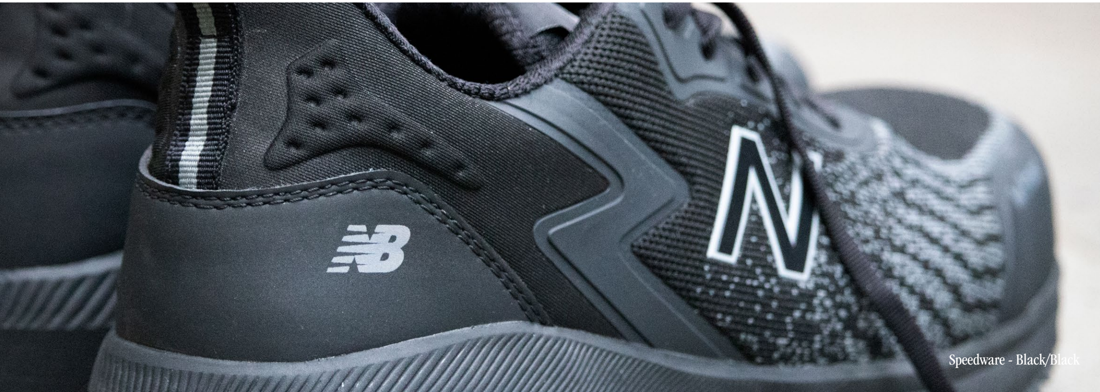
Speedware - Black/Black

New Balance Industrial's starting point is a functional, emotional and aspirational place and ends with an industrial shoe, aesthetically strong, providing COMFORT WHILE YOU WORK.