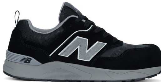
meelcap - black / grey