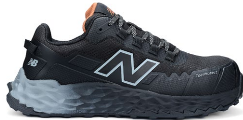
Fresh Foam Cremorne Womens ESR CT CP Black/Grey - WEFCCAPBG

STANDARDS EN 20345:2022+A1:2024 Class I S3L SR HRO SC SR ESD AS 2210:2019 Class I S3 HRO SRC ESD