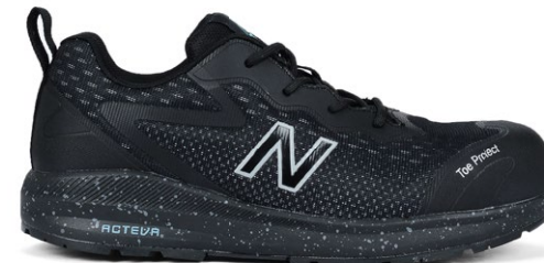
widlogi - black / aqua