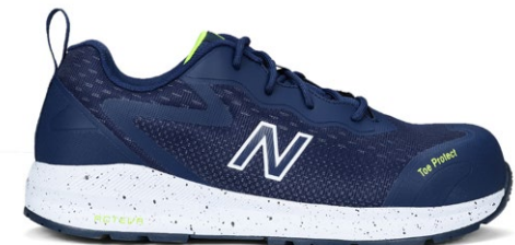
midlogi - navy / lime