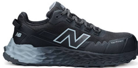
Fresh Foam Cremorne Black/Grey - MEFCCAPBG