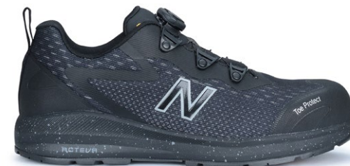
midlogiboa - black / orange

EN ISO 20345: 2022 - Class I S1 PL SR FO HRO