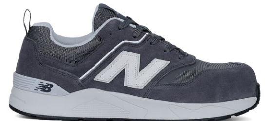
weelcap - magnet / whispy blue