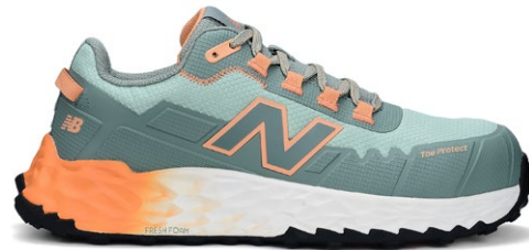
Fresh Foam Cremorne Womens Aqua/Pumpkin - WEFCCAPAP