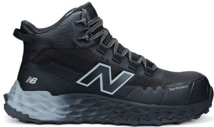
Fresh Foam Cremorne Black / Grey - MEFCMCAPGB

Our unique anti-perforation is made from one of the three major high performance fibers in the world with strength ten times greater than that of high-quality steel and density lower than water. This anti-perforation delivers a soft, water resistant matter with excellent abrasion and flexing resistance.