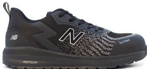
midspwr - black / black

AS 2210.3: 2019 - Class I S1 P HRO SRC EN ISO 20345: 2022 - Class I S1 PL HRO FO SR