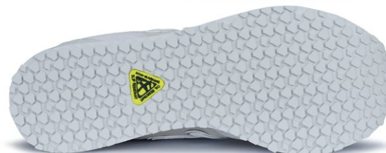
515 SR Womens Grey