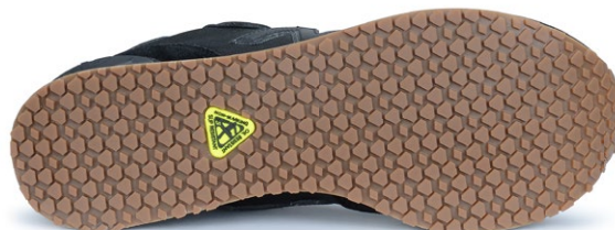
515 SR Mens Black