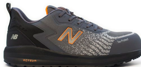
midspwr - grey / orange