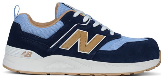
meelcap - blue / coffee

AS 2210.3:2019 - Class I S1 P HRO FO SRC ESD EN 20345:2022 - Class I S1 PL HRO FO SC SR ESD