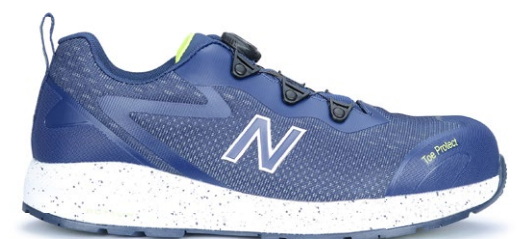
midlogiboa - navy / lime