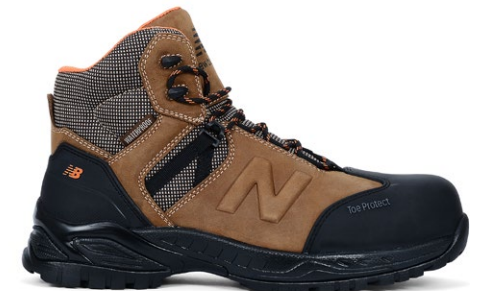
midalls - rustic brown / black