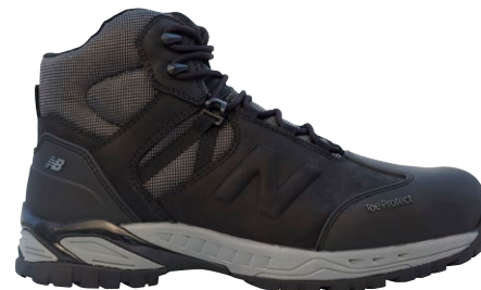
midalls - black / black