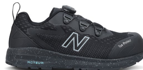
widlogiboa - black / aqua

EN ISO 20345: 2022 - Class I S1 PL SR FO HRO