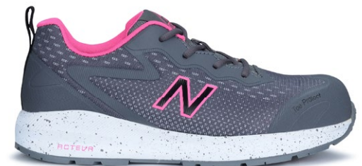
widlogi - grey / pink