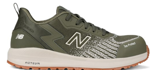
midspwr - olive / white