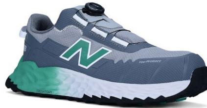
Fresh Foam Cremorne BOA Alloy/Green - MEFCCAPBAG