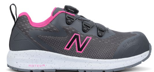
widlogiboa - grey / pink