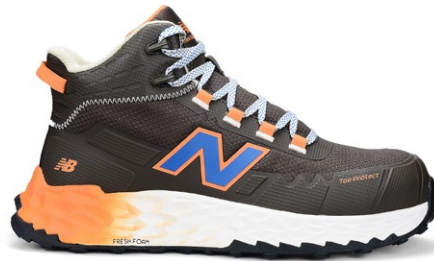
Fresh Foam Cremorne Chocolate / Orange - MEFCMCAPCO