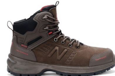
midclbre - chocolate