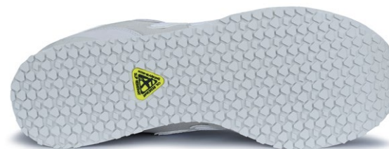
515 SR Mens Grey