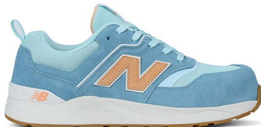
weelcap - milky blue / orange

EN 20345:2022 - Class I S1 PL HRO FO SC SR ESD AS 2210.3:2019 - Class I S1 P HRO FO SRC ESD