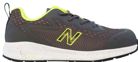
midlogi - grey / lime

AS 2210.3: 2019 - Class I S1 P HRO SRC EN ISO 20345: 2022 - Class I S1 PL SR FO HRO