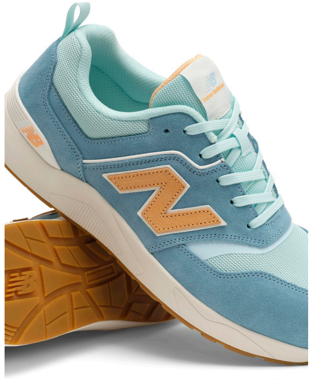
Elite Lite - Milky Blue / Orange

New Balance innovation continues to be about changing the footprint of running.