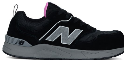
weelcap - black / rose