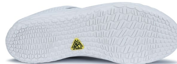
906 SR Womens White