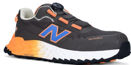
Fresh Foam Cremorne BOA Chocolate/Orange - MEFCCAPBCO

STANDARDS EN 20345:2022+A1:2024 Class I S3L SR HRO SC SR ESD AS 2210:2019 Class I S3 HRO SRC ESD