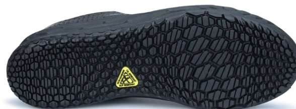
906 SR Womens Black