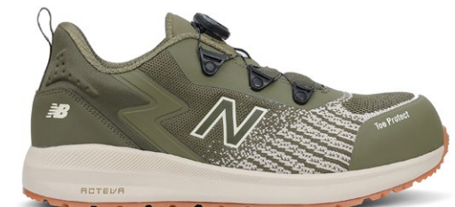
midspwrboa - olive / white