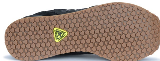
515 SR Womens Black