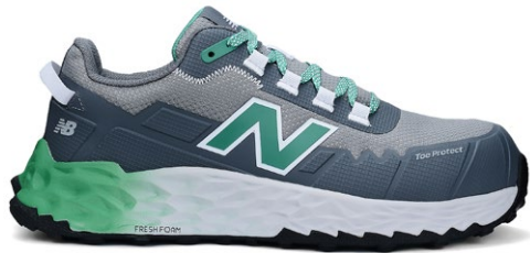
Fresh Foam Cremorne Alloy/Green - MEFCCAPAG

Our unique anti-perforation is made from one of the three major high performance fibers in the world with strength ten times greater than that of high-quality steel and density lower than water. This anti-perforation delivers a soft, water resistant matter with excellent abrasion and flexing resistance.