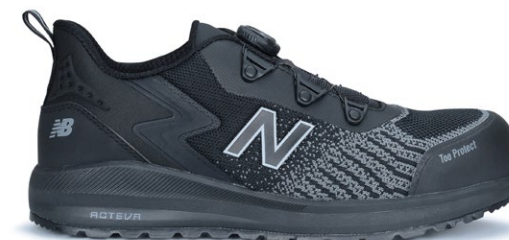
midspwrboa - black / black

EN ISO 20345: 2022 - Class I S1 PL SR FO HRO